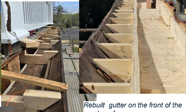
Rebuilt gutter on the front of the porch roof.