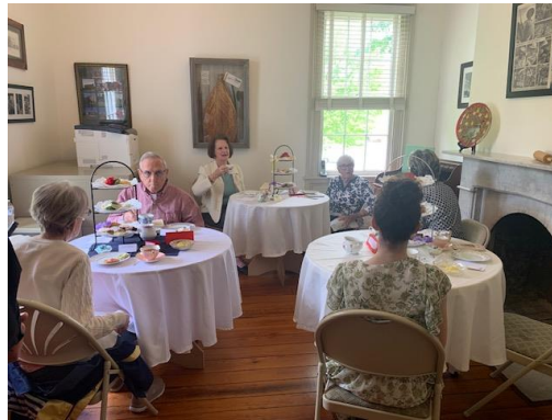
Tobacco Room at Linden decked out for the tea.