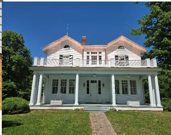
Above left: Rebuilt porch floor before copper roof. Left: Shiny new copper porch roof Above: Notice the pink glow of the second floor of Linden!