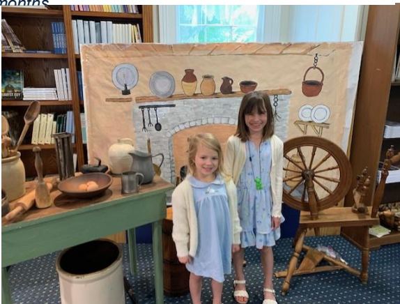
Young guests at the tea learn about a colonial kitchen from the painting of the kitchen at the Paca House and colonial kitchen items on loan from CCHS members.