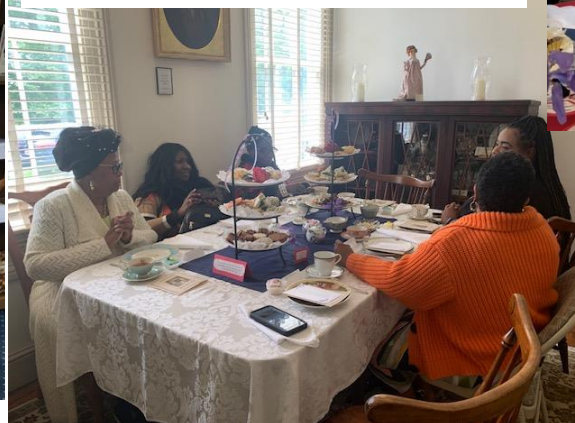
Tea Table in the Dining Room at Linden

Did you know there are approximately 18,275 historical societies in the United States.