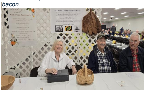
Greeting breakfast guests